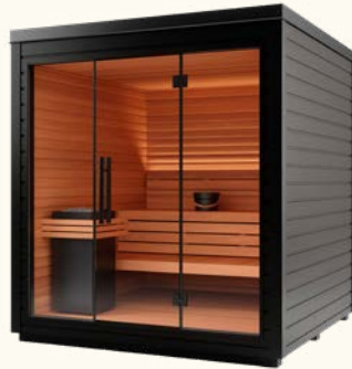
MIRA L in black cladding