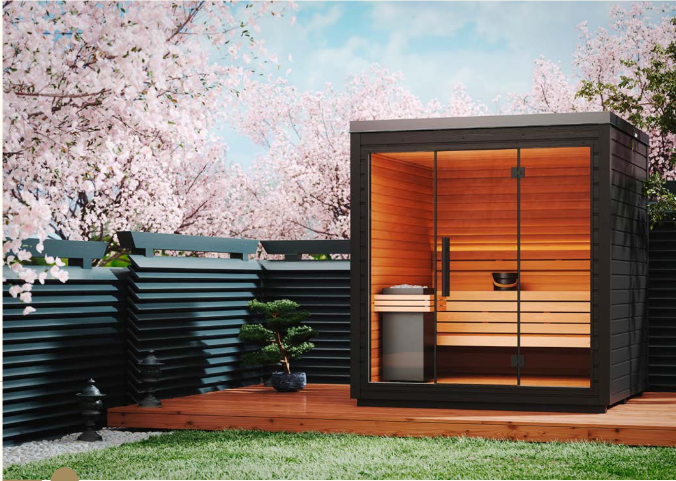
Mira model L in black cladding