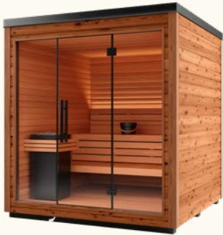
MIRA L in natural cladding