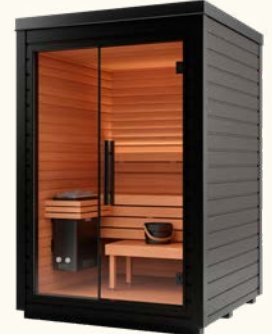
MIRA S in black cladding