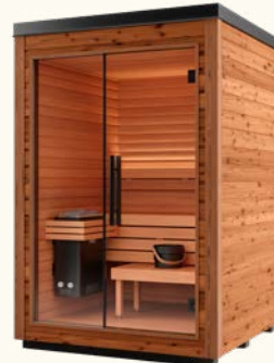
MIRA S in natural cladding